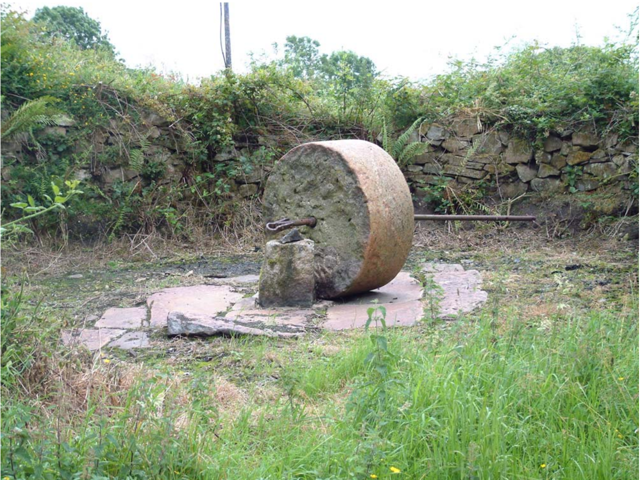
Culm Crusher at Old Leighlin

AGE OF ROCKS: Ordovician to Carboniferous; Quaternary