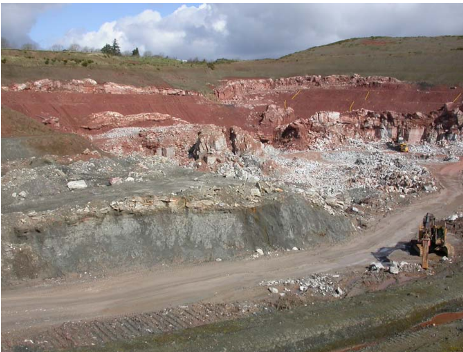
Red Permian mudstone and gypsum, and grey rotted basalt, at the Knocknacran opencast mine.

Knocknacran Mine, a few kilometres south of Carrickmacross, has been worked both underground and opencast. It is Ireland's most important producer of gypsum and has long been a major source of plaster products for the construction industry.