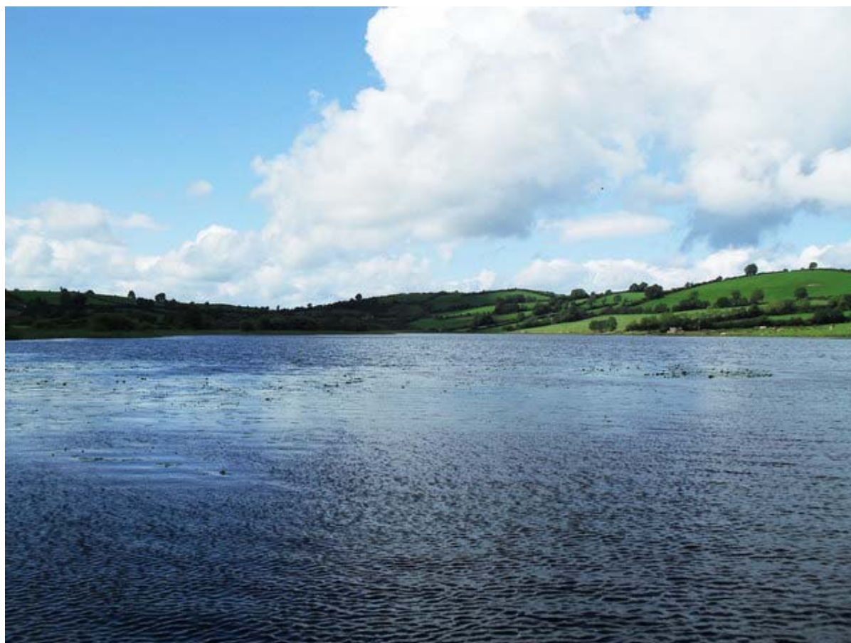
Milltown Lake, Oram, near Castleblayney

AGE OF ROCKS: Ordovician, Silurian, Carboniferous, Permian, Triassic, Paleogene