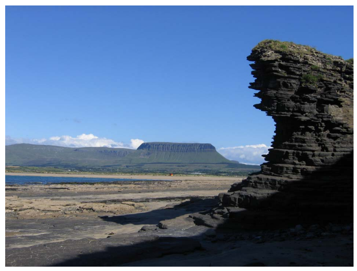
Streedagh Point and Ben Bulben

AGE OF ROCKS: Precambrian; Devonian to Carboniferous, Paleogene