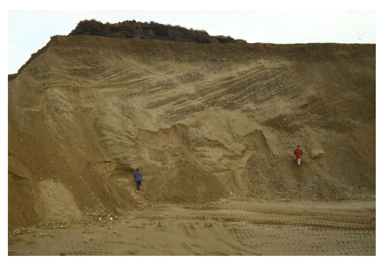
Gravels deposited on a delta in a glacial lake in the Sperrin Mountains

AGE OF ROCKS: Precambrian, Ordovician to Triassic, Cretaceous to Palaeogene, Pleistocene