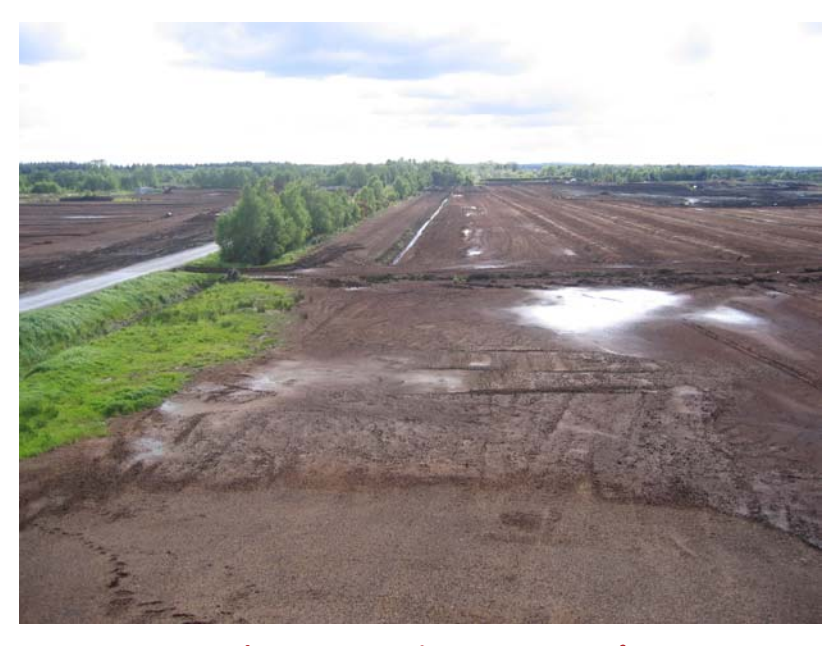
A bog near Derravaragh

The final stage of landscape evolution has been the growth in the last 10,000 years of raised bogs in wet depressions in landscape. Groundwater in Westmeath is also an important part of its geology. Water from Lough Lene flows to the River Deel and hence to the Boyne and the Irish Sea. Underground drainage goes to the springs at Fore and onto the River Shannon and the Atlantic.